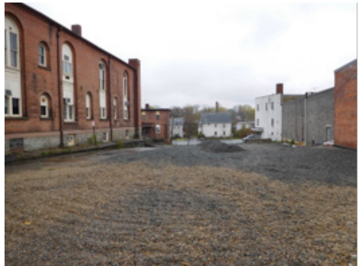
Empty lot in Downtown.

A common complaint by business owners is the time it takes to line up the necessary city permits to do everything from opening a new store to building new apartments. It can take months to win the necessary zoning relief and obtain a building permit and other required approvals, business owners and developers report. There were examples provided of some business owners being denied permits, with no explanation regarding the appeal process. While this is a common problem for communities, it has a greater impact in gateway communities such as Taunton in that the economics of expanding or opening a business in such communities are already challenging. Based on conversations with panelists, this additional burden has impacted development in the City. In order for Taunton to gain a competitive edge, the City would best be served by having as seamless, efficient and predictable a process as possible. As a part of this it would be beneficial for town employees to be clear about all of the approval options available to a retailer/restrateur if they have to deny a permit or approval.