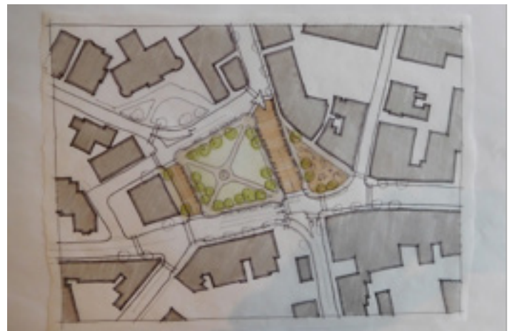
Proposed connections between Taunton Green and surrounding sidewalks.