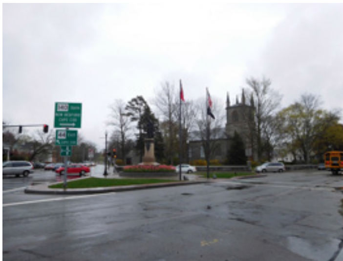
Road design around downtown favors vehicular traffic over pedestrian and bicycle traffic.

There is strong support for new market-rate housing and commercial development downtown. But without tax credits or other forms of assistance, neither is feasible given the current rents. Commercial rents downtown are not high enough to make ground up construction work. Meanwhile, commercial taxes are high compared to other local communities, at nearly $35 per $1,000 of assessed value, or the highest possible rate allowed under state law given the city's residential rate of $15.68. Renovating upper floors of downtown commercial buildings for residential use – an idea that is also being explored by local developers – also faces challenges. It would cost an estimated $197,000 to build out each second floor unit. To earn a 7 percent return, a developer would have to charge $1,800 a month in rent. However, the median rent for a two-bedroom in Taunton, at $1,259, does not support such an investment. In order to move forward, the developer would need a $63,000 subsidy per unit. Parking ratios – the requirement that residential developers must have a certain number of parking spaces under their control for each unit – is an additional challenge facing would-be apartment and condo builders.