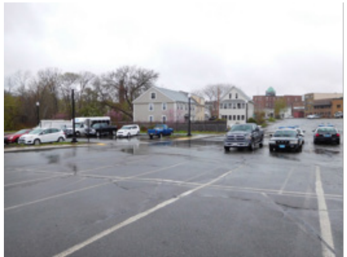
Clear signage could alleviate parking issues.

There is perception that downtown Taunton has a crime problem. While there are occasionally scattered incidents, the idea that the city's center is a dangerous place – particularly at night - is not backed up by crime statistics. Helping feed that concern is a lack of adequate street lighting at night, as well as sparse foot traffic in the evening hours.