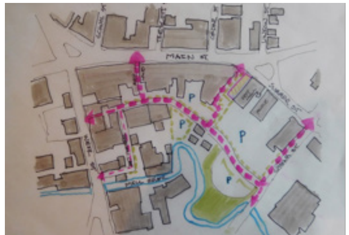
Wayfinding and street improvement updates will help with both directing vehicular traffic and finding parking

City officials may also want to consider revising signage regulations. Current rules prohibit "blade signage," making it difficult to identify businesses for those driving or walking through downtown.