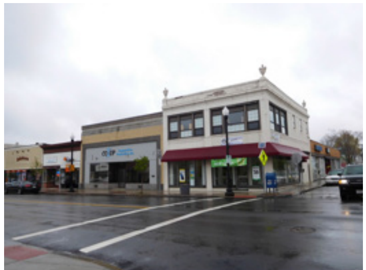
Images from the walking tour of Downtown Taunton.