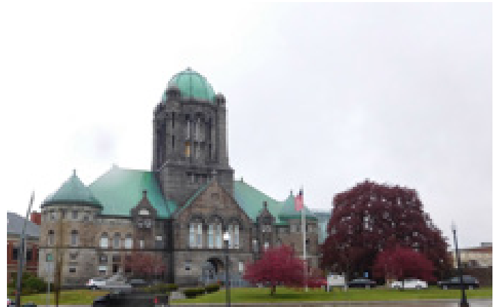
Beautiful buildings surround Taunton Green.

Downtown Taunton is beautiful, with handsome, relatively well-maintained 19th and early 20th century commercial buildings and a centerpiece greenspace, Taunton Green. Currently underutilized, the Green