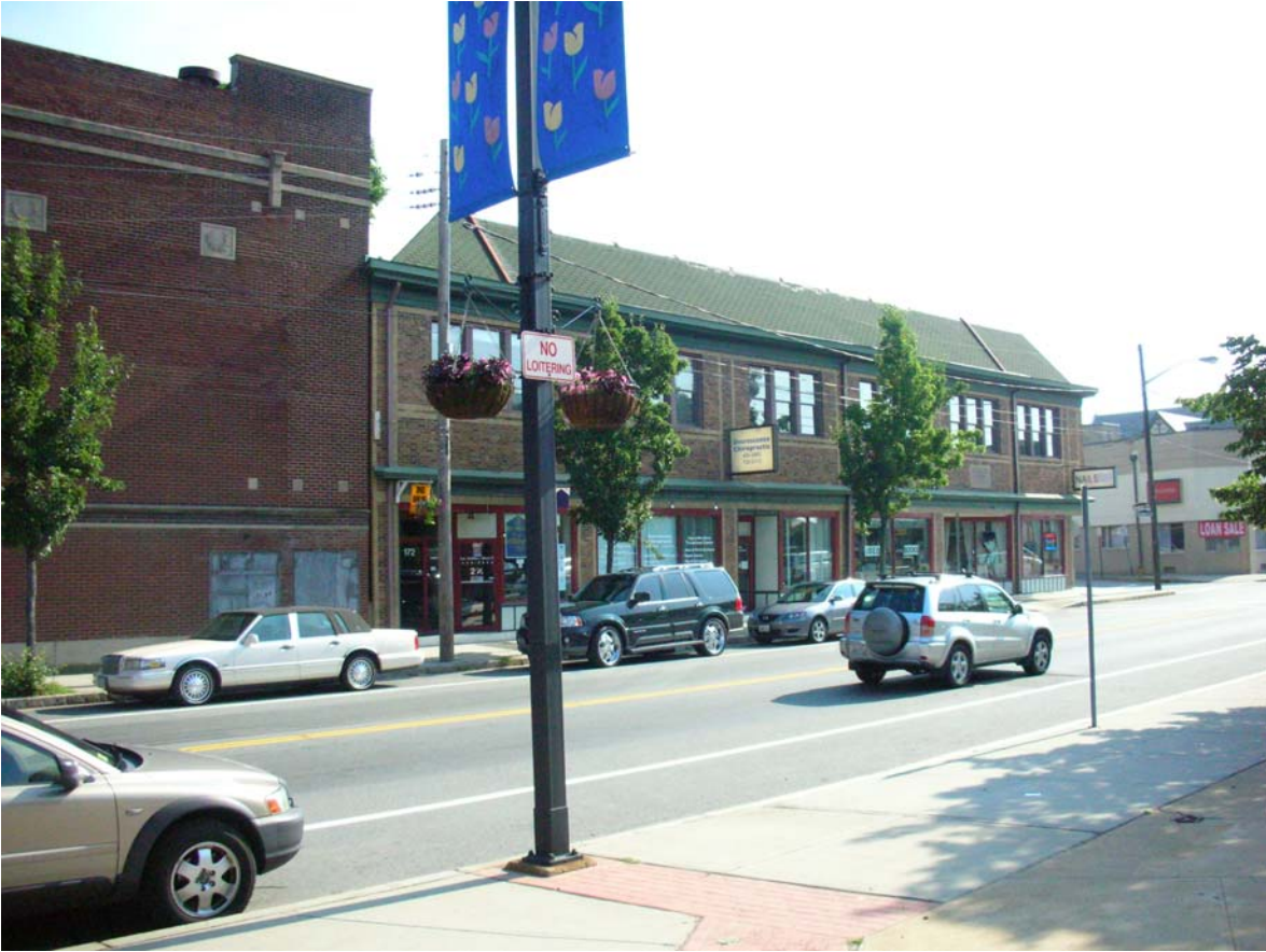
The Theatre (left) and adjacent business on Taunton Avenue. The panel deemed the multi-use building to the right a good example of multi-use development in the area.