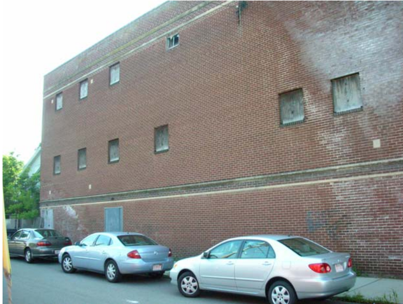
Bomes Theatre - side view