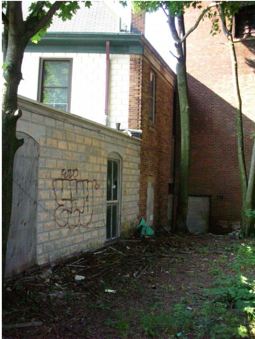
Vandalism behind the Bomes Theatre continues to exasperate area business and property owners.