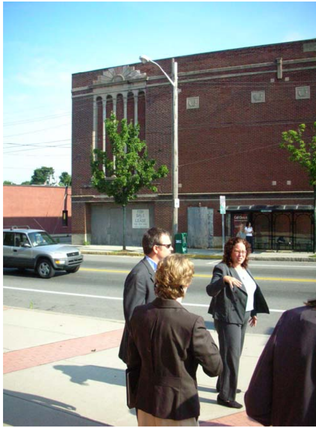
Bomes Theatre- view from Taunton Avenue from the sidewalk of East Providence City Hall.

It was concluded that due to current lease rates in the area and the high development costs for rebuilding the site, redevelopment of the Bomes Theatre site is dependant on an Institutional or non-traditional investor.