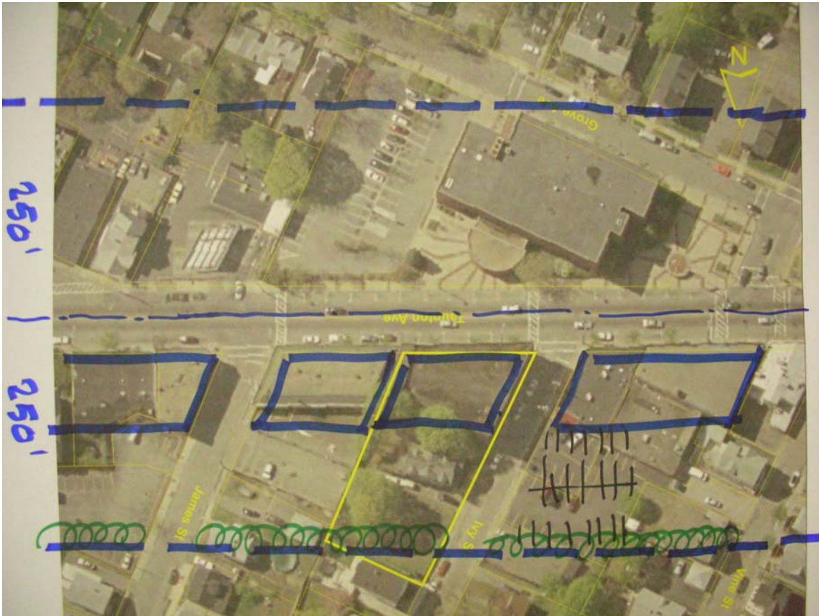
Suggested Taunton Ave. Development